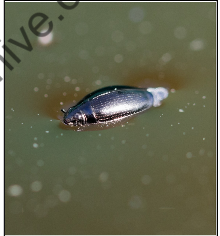
No. 10. Whirligig Beetle in Water.

Whirligig Beetle.