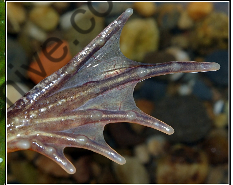
No. 06. Hind leg detail of Common frog.