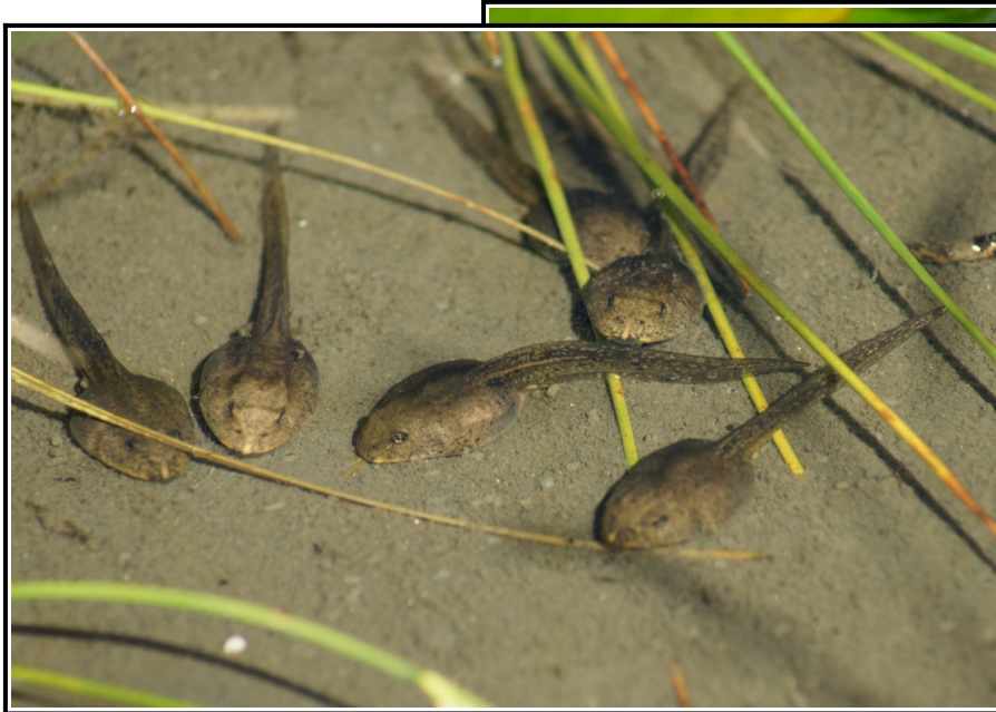
No. 03. Tadpoles in the Early Stage of Development.