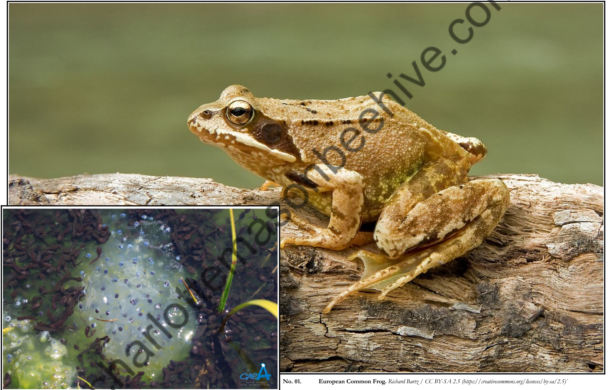
No. 01. European Common Frog. Richard Bartz / CC BY-SA 2.5 ( https://creativecommons.org/licenses/by-sa/2.5 )`