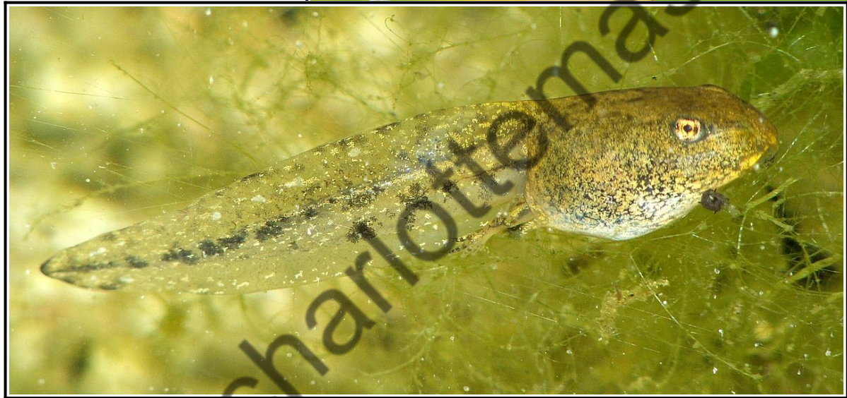
No. 05. Tadpole of the common frog just before metamorphosis.