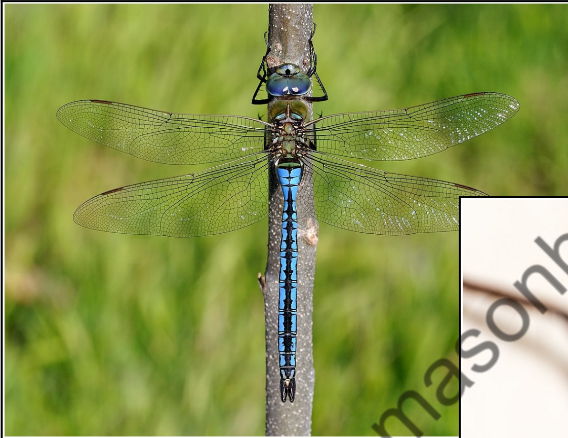
No. 13. Emperor Dragonfly. Quartl , CC BY 3.0 ( https://creativecommons.org/licenses/by/3.0 )