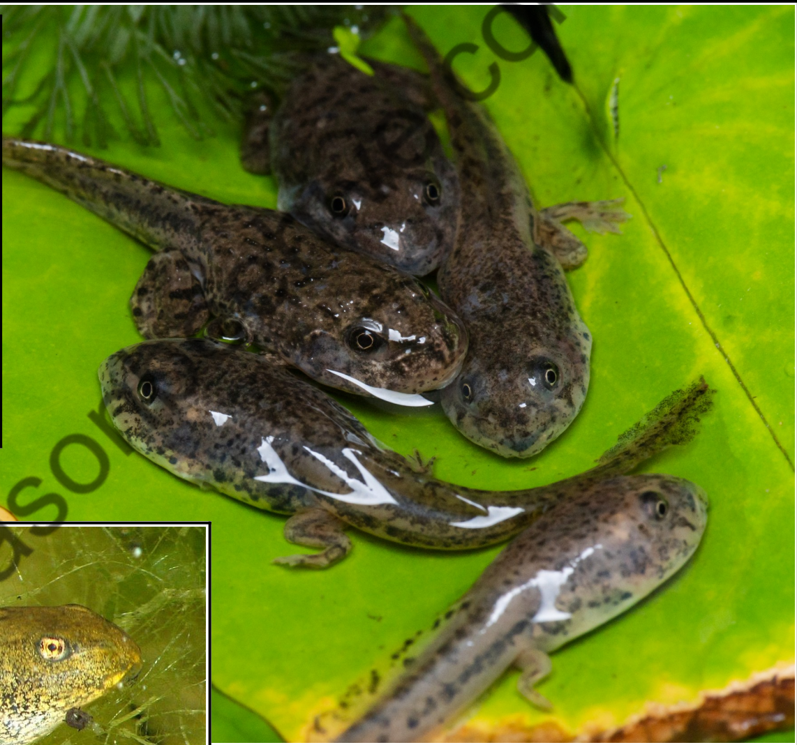
No. 04. Tadpoles developing hind legs.