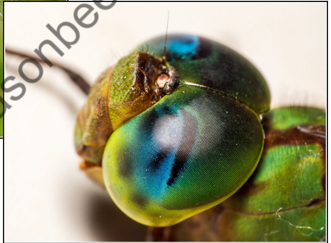
No. 14. Dragonfly Eyes Close Up.