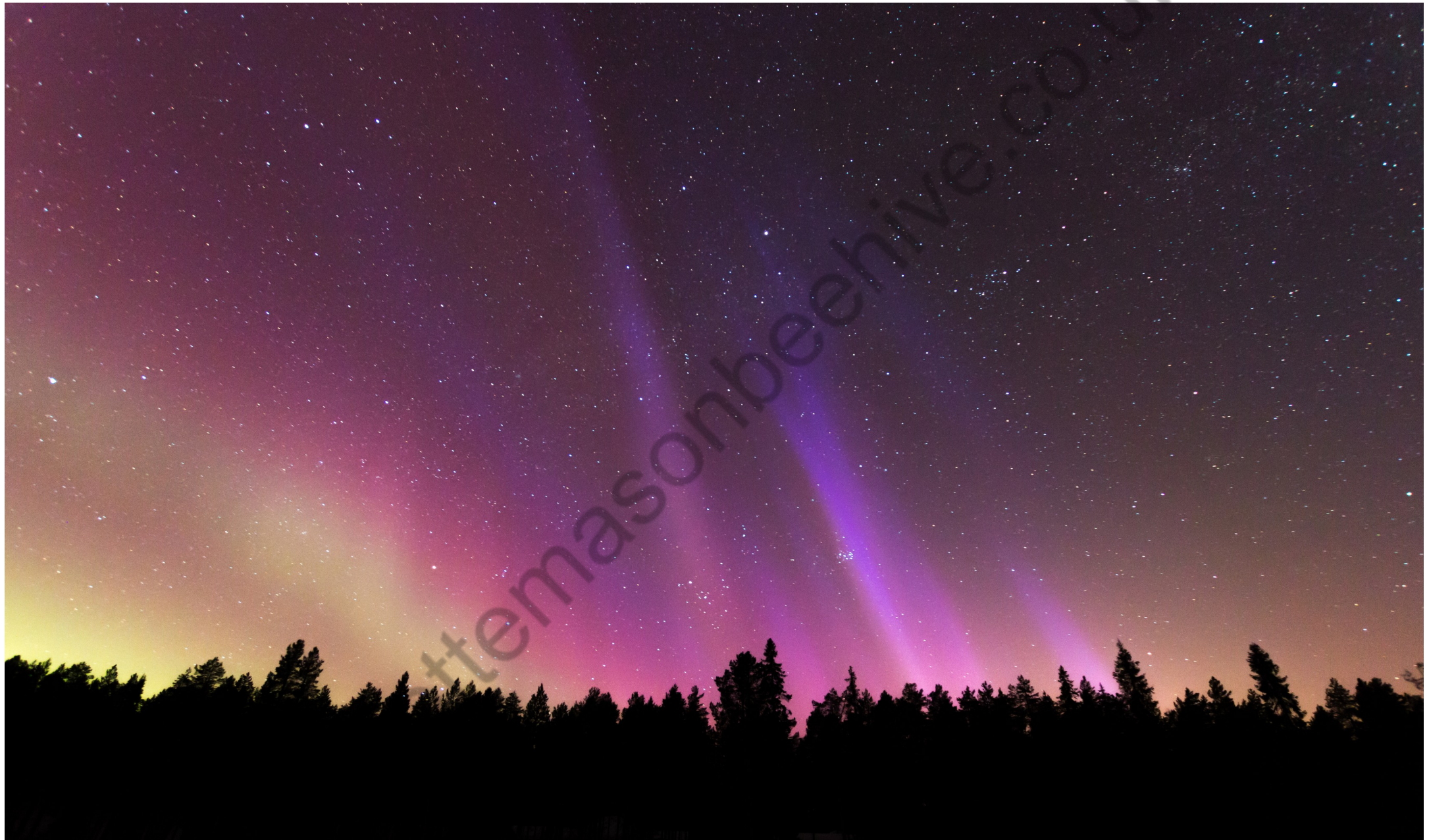
No. 05. The Northern Lights. Markus Trienke [CC BY-SA ( https://creativecommons.org/licenses/by-sa/2.0/ )]